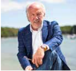
David Richards Chairman of Prodrive and Motorsport UK